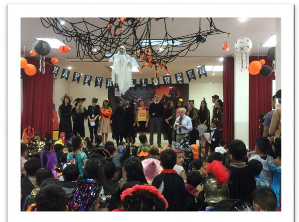
Our colourful Halloween Celebrations at SIS@Ciputra saw both students and teachers joining in the celebrations.