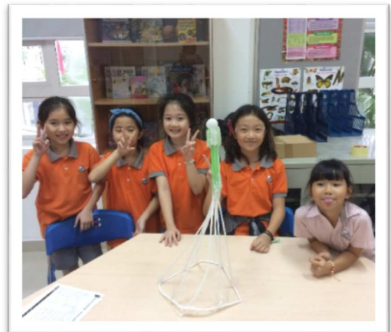
Our students from STEM CLUB posing with their STEM Challenge project to design a tower made from 40 straws which can support the weight of a ping pong ball.