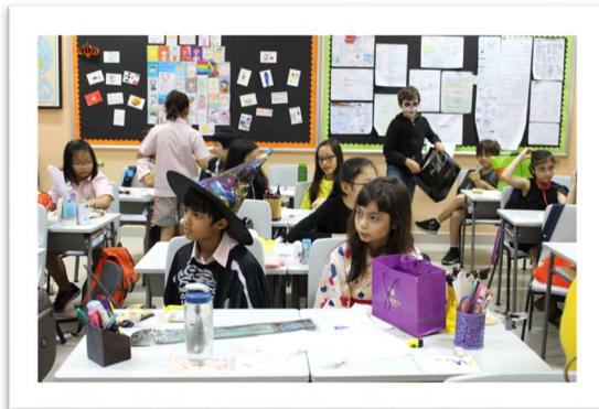
Halloween Celebrations in our classroom were so much fun!