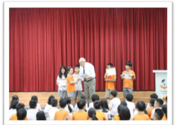
Student of the Month Presentation Assembly.