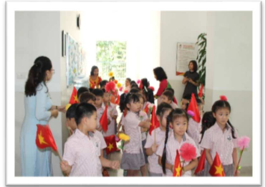
(Top and Bottom) Our Integrated students at the special assembly celebrating the 64 th Anniversary of the liberation of Hanoi, from the French.

We will continue striving to raise the quality of teaching and with the strong support from parents; I believe we will have a wonderful school year.