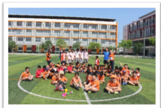
Participants of the SIS soccer friendly tournament posing for a group photo.