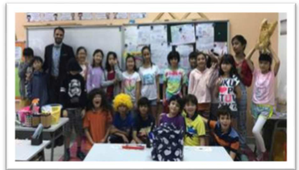
Our Year 5 students posing for a photograph on Colour Day.