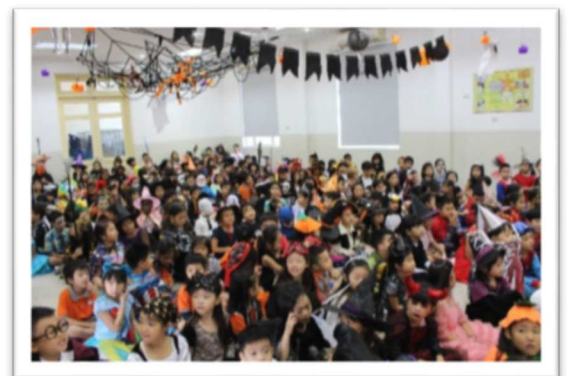
(Top and Bottom) Our students celebrated Halloween in style this year with many dressing up in spooky costumes. Here they are at the morning assembly.