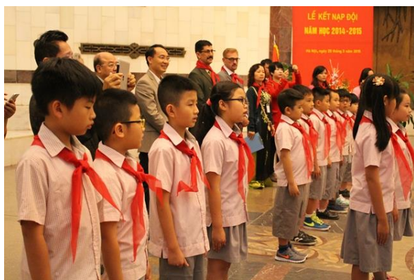
Ceremony Young Pioneers at the Ho Chi Minh museum