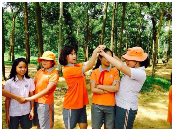
Year 5 students go to Son Tinh Camp