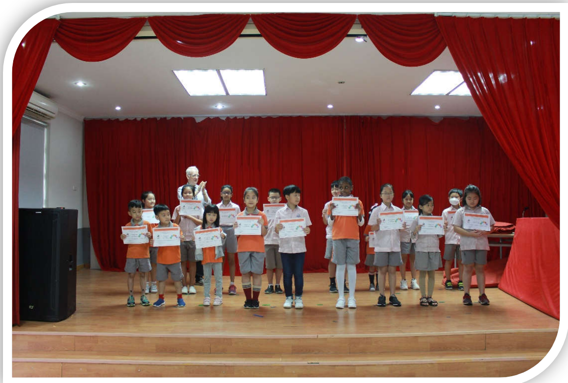
October Students of the Month