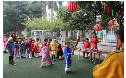
Our Children were treated to an array of traditional games, such as breaking the pot (above), the tug-of-war, and the sack race (below), to celebrate the coming of the New Year

Also in mid-February, our Grade 3 and 5 students sat for the International ISA test, which is designed specifically for students in international schools and schools with an international focus. By analysing our students’ performance during these tests, it helps us in evaluating instructional programs against