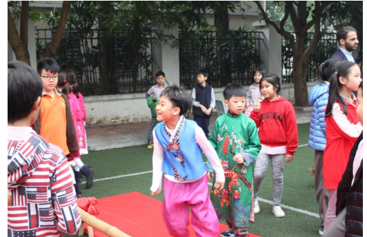
Many students especially loved the game called "balancing on the bamboo bridge, which was a test of both balance and dexterity.