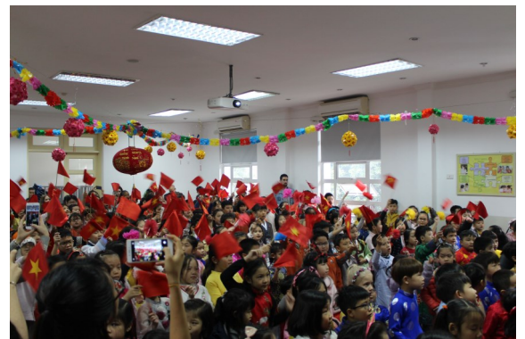
Students in the Multi-Purpose Hall chanting the final "Tet" song during the Tet morning assembly. Many of the students and staff came dressed in traditional clothes to celebrate the occasion.