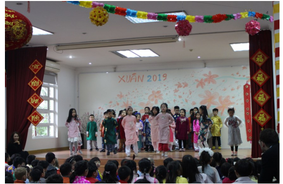
Our talented students from Year 1 integrated dressed in traditional clothes seen here performing a song and dance at the TET assembly.