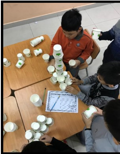
Right: Our grade 3 Integrated students busy with STEM challenge 1: building the tallest tower with only 100 paper cups.

their mechanical hands. At the end of the week learners had a cardboard hand they could control on their own, and enjoyed seeing what they could carry with their 'extra hand.'