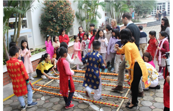
Staff helped with the bamboo poles as the children made their way through the gauntlet to complete the bamboo dance.

With the combined cooperation and strong support of parents, the school, teachers and students we will have an enjoyable and successful second semester.