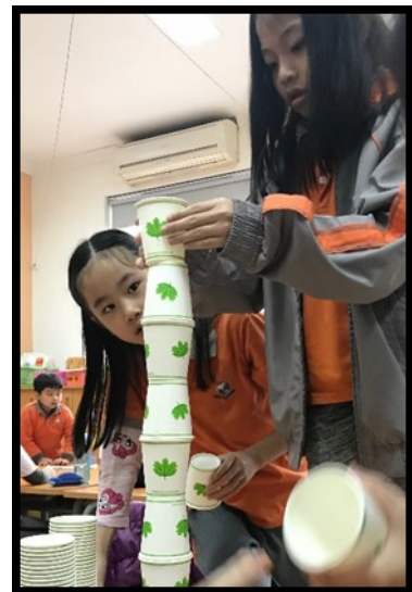
Our grade 3 Integrated students busy with STEM challenge 1: building the tallest tower with only 100 paper cups.

We continued with STEM week by presenting the learners with the challenge of making a cardboard hand that could carry an object from one place to another. After brainstorming and testing some ideas together as a class we settled on a final design and learners set to work constructing