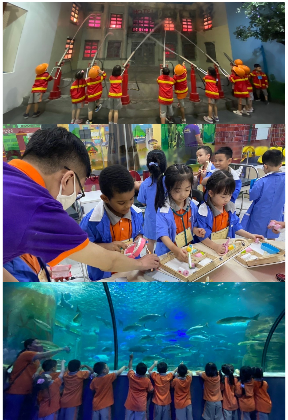
It was indeed a day full of fun!