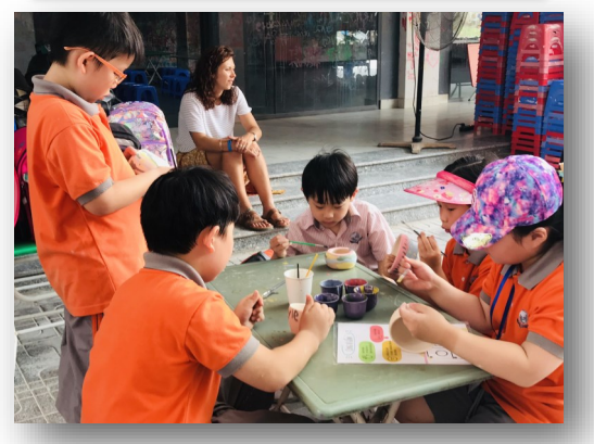
Our Grade 1 students on their excursion to Bat Trang Pottery Village had a marvelous time crafting little miniature clay figurines and baking them in the dragon kiln.