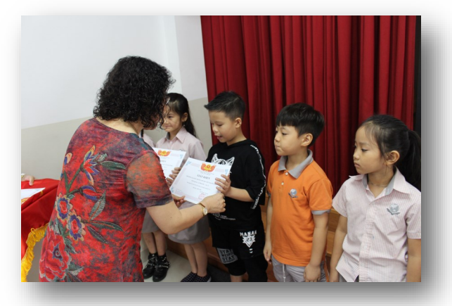
Students from 1 Integrated receiving awards from Madam Lien for good academic achievement in the Integrated Programme at our Vietnamese Assembly