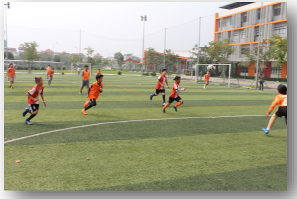
Our football team going for goal at the Sports Day. The footballers clinched the first Spot and brought back the winning trophy once again after convincing wins against SISGamauda and SIS Van Phuc