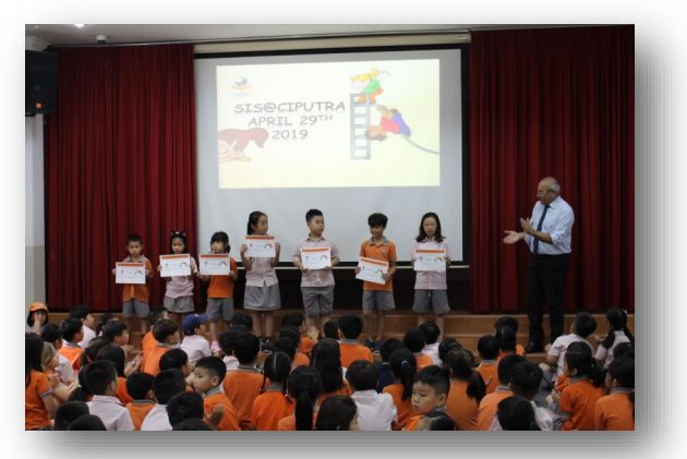
Students in the Multi-Purpose Hall at the awrds assembly receiving their Student of the Month Certificates from the Princiapl