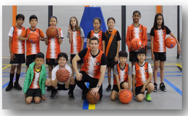
Our Basketball students emerged runners up in the Sports Day Event held at Gamuda Gardens for Grades 5 and 6.