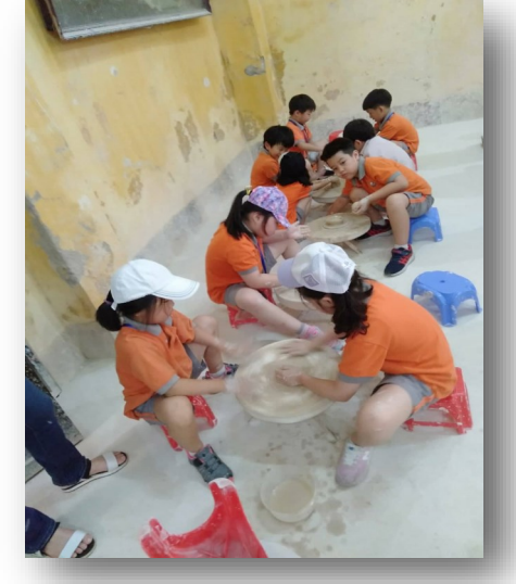
Our Grade 1 Children were treated to a hands on pottery workshop when they visited Bat Trang Pottery Village. Here they are seen moulding their clay shapes using a potter's wheel.