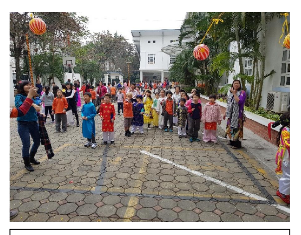
Students taking part in traditional games as part of the TET Celebrations in school