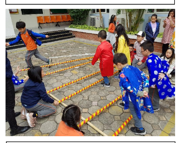
Students trying the traditional bamboo dance during the school's TET celebrations.