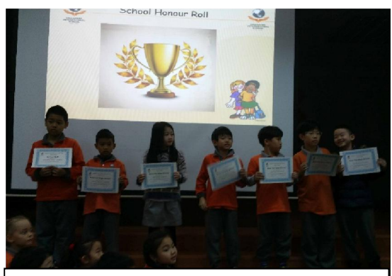
Students from Grade 3 receiving their awards for the School Honor Roll at assembly