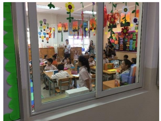
STEM Week was organized on the 17-21 st of September and students and parents got a chance to view their STEM projects that they had been working on for the week.

Our STEM Week was held from the 17 th to the 21 st of September, culminating in a STEM Parent Morning on the Friday of the week. On this day SIS@Ciputra was in “Exhibition Mode” and all students from Grades 1-6 took part. Parents and guests were invited into the school to see the STEM projects that students have been working on for the week. Students presented to their parents and guests and explained their finished projects and how they went about completing them. They also shared their difficulties and setbacks in the design process, and how they manage to overcome these setbacks before the final project was ready.