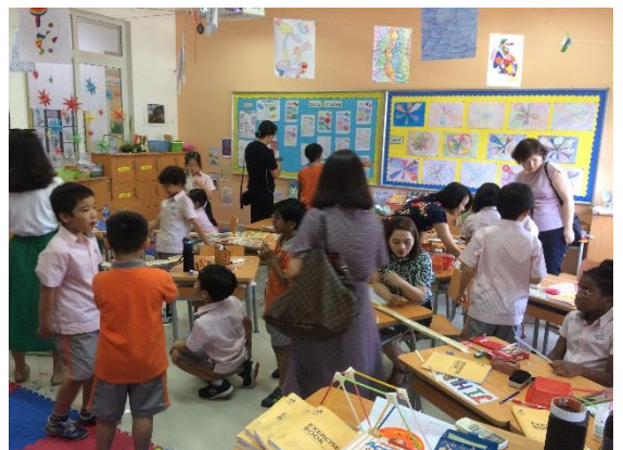
Impressed Parents were invited into their children’s classrooms on STEM Day, where they got a chance to view their children’s projects.