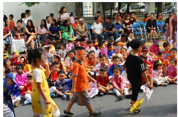
Students took part in the Lantern Parade and wore traditional costumes and masks