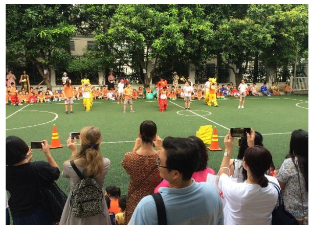
This year's Moon Festival Celebrations saw students from Upper Primary performing the Lion Dance.