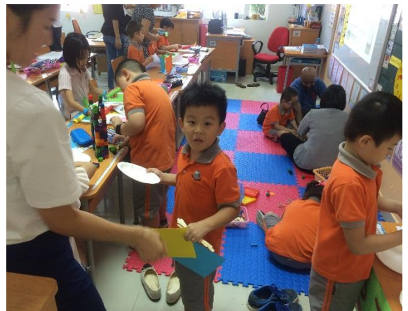
Parents enjoyed themselves at the STEM Day, as they got a chance to see their children presenting their STEM Projects.