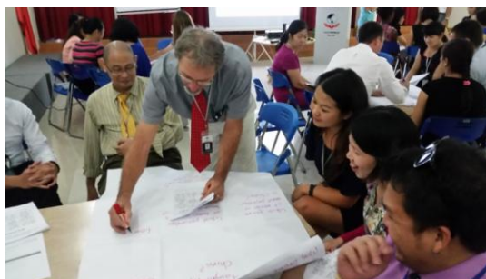
Teachers - Teaching- Teachers