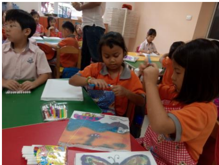
Students enjoying Art for Life