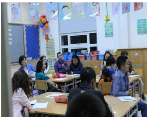
Parent Open House