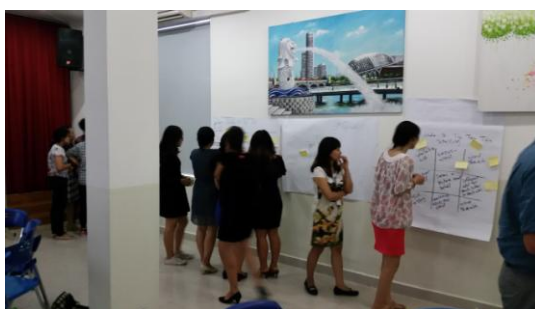
Teacher Professional Development