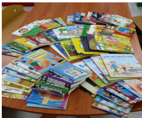
Donations to the Library