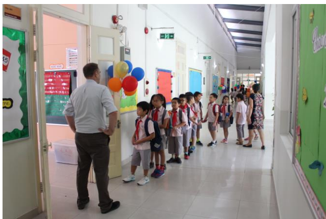
Welcome Back to School

The year has started off with great success and all of us have been dedicating ourselves to making this one of the best years at SIS. With our new highly qualified teaching staff and with our new school wide action plan we have set the bar even higher for ourselves and for the quality of education.