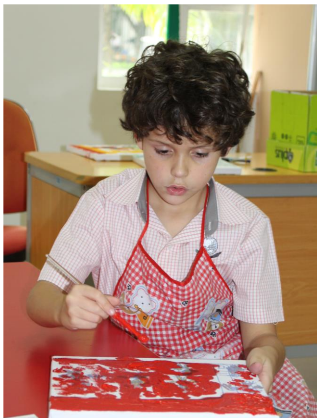
After School Art for life

As we make our way through this new academic year, your children will have the opportunity to benefit from the vast experience and expertise that our staff has to offer. They will be challenged to reach even higher levels of ability and be stretched to go beyond even their own expectations. I encourage you to continue to work with your children and help grow into the amazing global citizens for tomorrow.