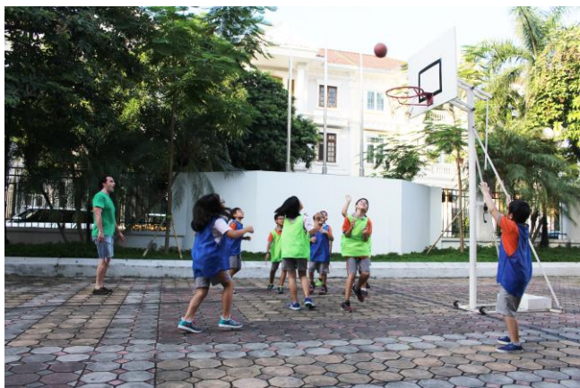
After School Activities Basketball Club