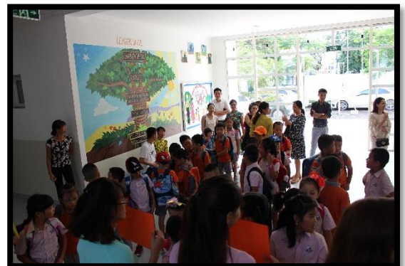
Excited students, parents and teachers gather in the school's foyer on the first day of school.