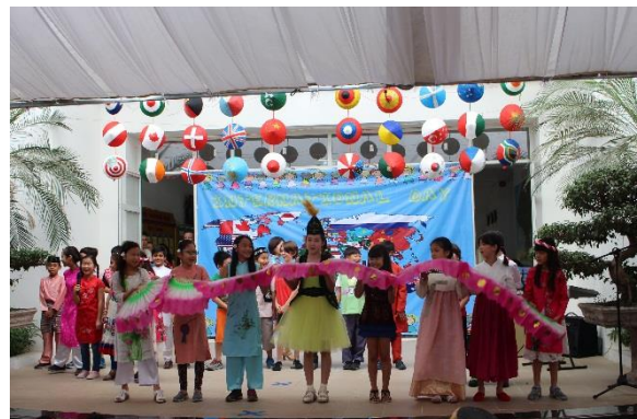
The students from Grade 4 International collaborated to perform a Mandarin song, "Molihua" as part of the lineup of performances.