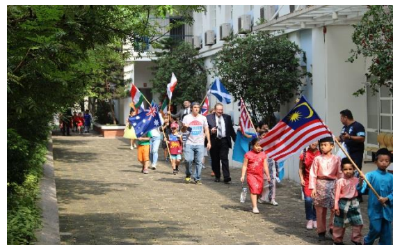
Students marched round their school in their National contingents to celebrate International Day's Parade of Nations. (above and below)