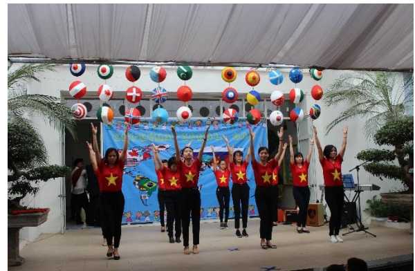
Our Vietnamese Department also joined in the festivities by performing "Vietnam Oi."