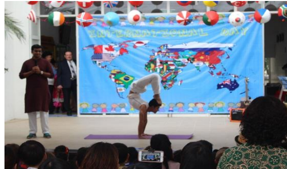
A yoga demonstration, organized by the Indian Parents, amazed many members of the crowd