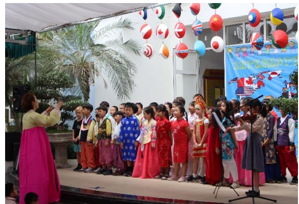
Our Korean parents helped to conduct the Korean Cultural Song "Arirang" at International Day